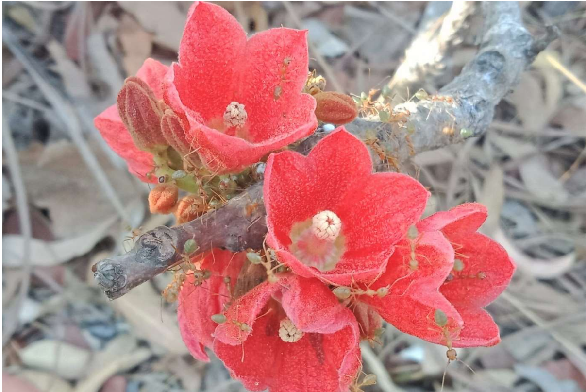
Red-flowering Kurrajong ( Brachychiton megaphyllus ) is the City of Darwin's Floral Emblem