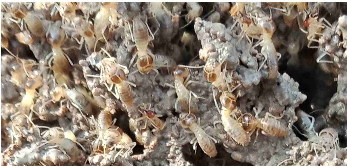
Termites building a nest at Lee Point

Native Sorghum seeds are eaten by ants and grass finches. Speargrass is a type of sorghum. Grass finches eat insects to supplement their diet. Insects like termites are high in protein.