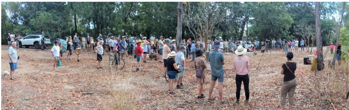
Up to 200 people attended the public rally and other activities on the day.