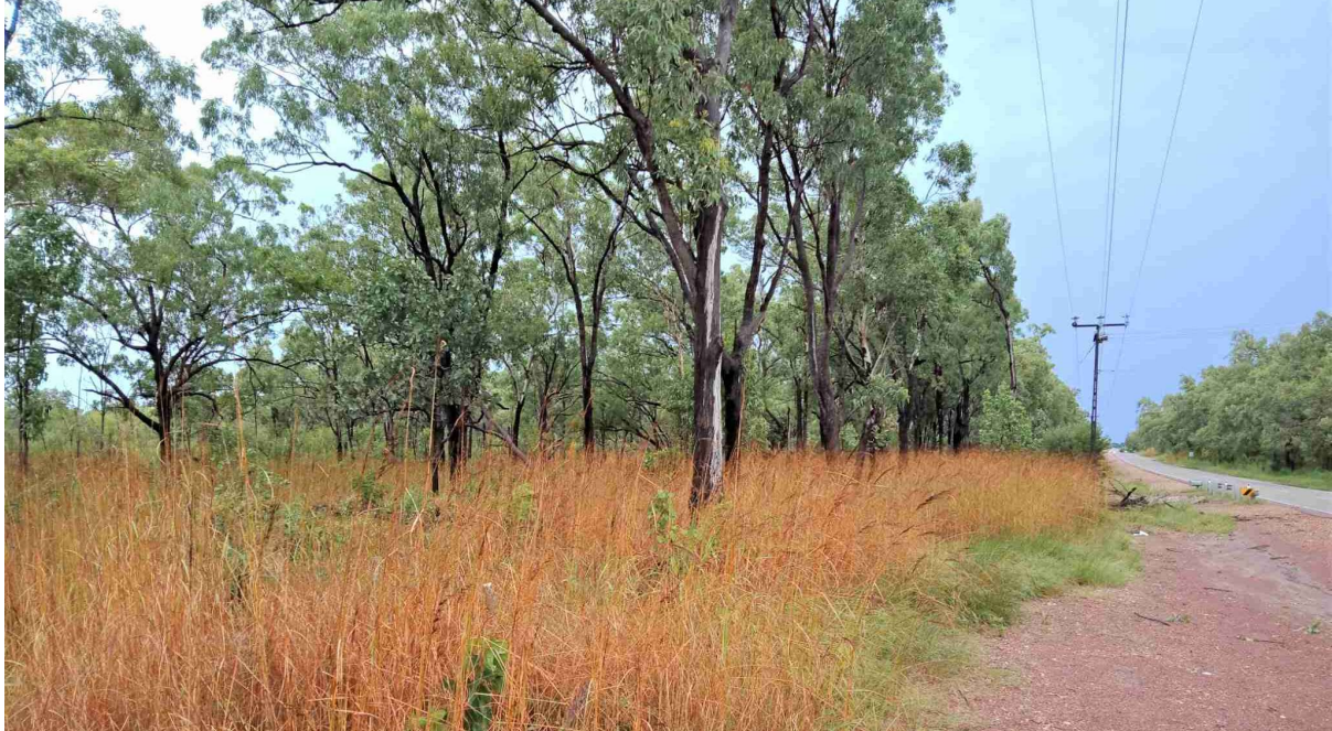
Sorghum grass in late March along Lee Point Road looking south from Osprey Tower

The Corridor has lots of different grass seeds and watering points for grass finches. Grass finches breed when food is plentiful, some breed all year round. Gouldian Finches (a type of grass finch) typically breed in tree hollows during April – May.