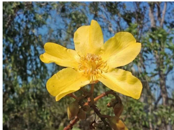
Kapok Bush or Tree ( Cochlospermum fraseri ) east of the Lee Point caravan park Late dry season can be bad for biting insects; please check this Calendar

Until next time, enjoy the last of the Dry Season at Lee Point