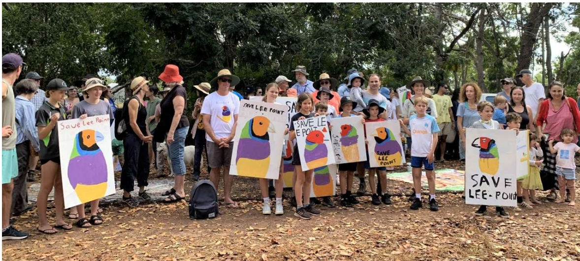
Part of the rally included painting corflutes with gouldian images.