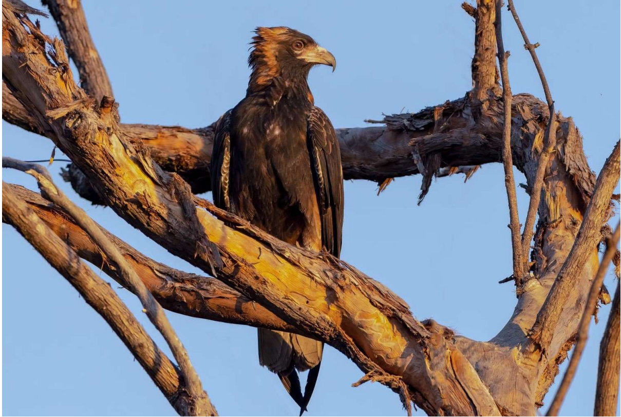
Black-breasted Buzzard south of Lee Point Dam

The Black-breasted Buzzard is building a nest, a first for Darwin. They are known for using rocks to break emu and brolga eggs – only two bird species in the world use this technique.