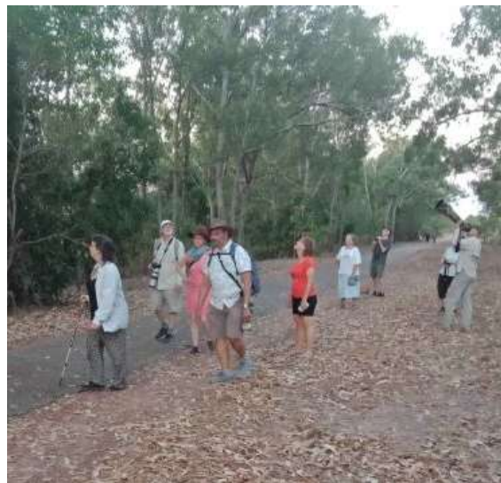
People looking at a Tawny Frogmouth near the Osprey Tower.

The Tawny Frogmouth is a common nocturnal bird of Darwin. It likes insects and small invertebrates and nests in tree hollows. One caravan park visitor said: you should see what happens after dark – lions and tigers!