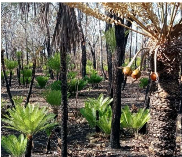
Photo A (July 2021). The finest stand of Darwin Cycads in Lee Point and Casuarina Coastal Reserve was lost. Only about 200 out of the 600 cycads were saved.

Looking towards Lee Point with Muirhead in the foreground. Stage 1A was cleared early Oct 2021. There are 5 stages with clearing planned for both sides of the road. Photos A and B are below.