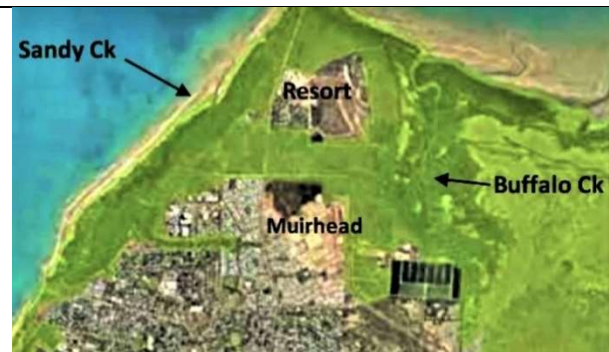
Biodiversity corridors from City of Darwin's Greening Darwin Strategy