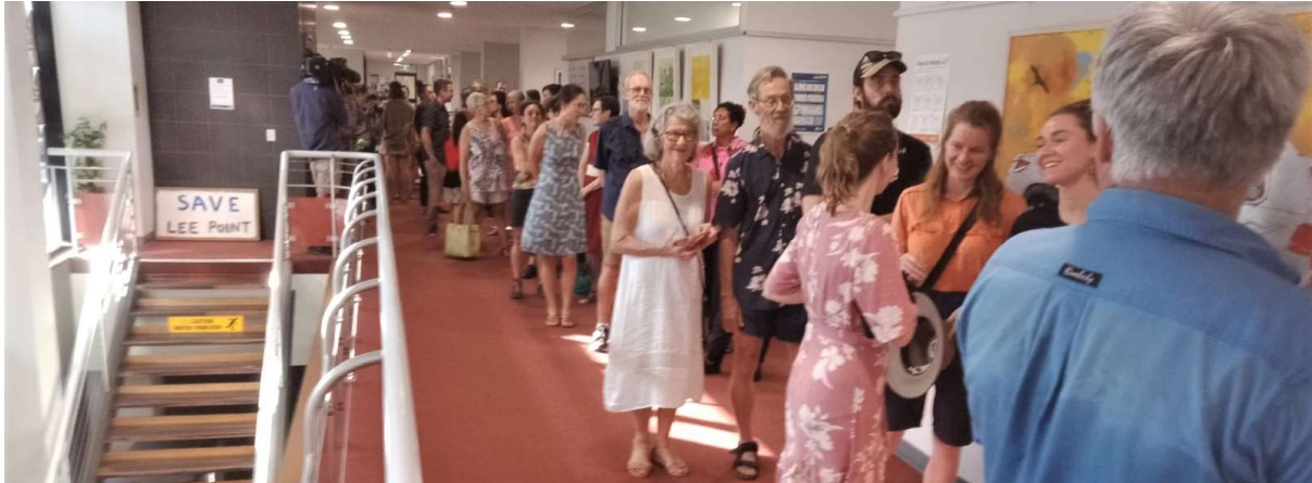
People lining up to get in to watch the council discuss/vote on the Save Lee Point motion.

The Save Lee Point motion asks the Planning Minister to put a moratorium on the current development of Lee Point until the NT Planning Commission, an independent authority, has developed a comprehensive area plan for the whole of Lee Point as it has done for other published area plans such as the Central Palmerston Area plan and the Humpy Doo Rural Activity Centre Master Plan.