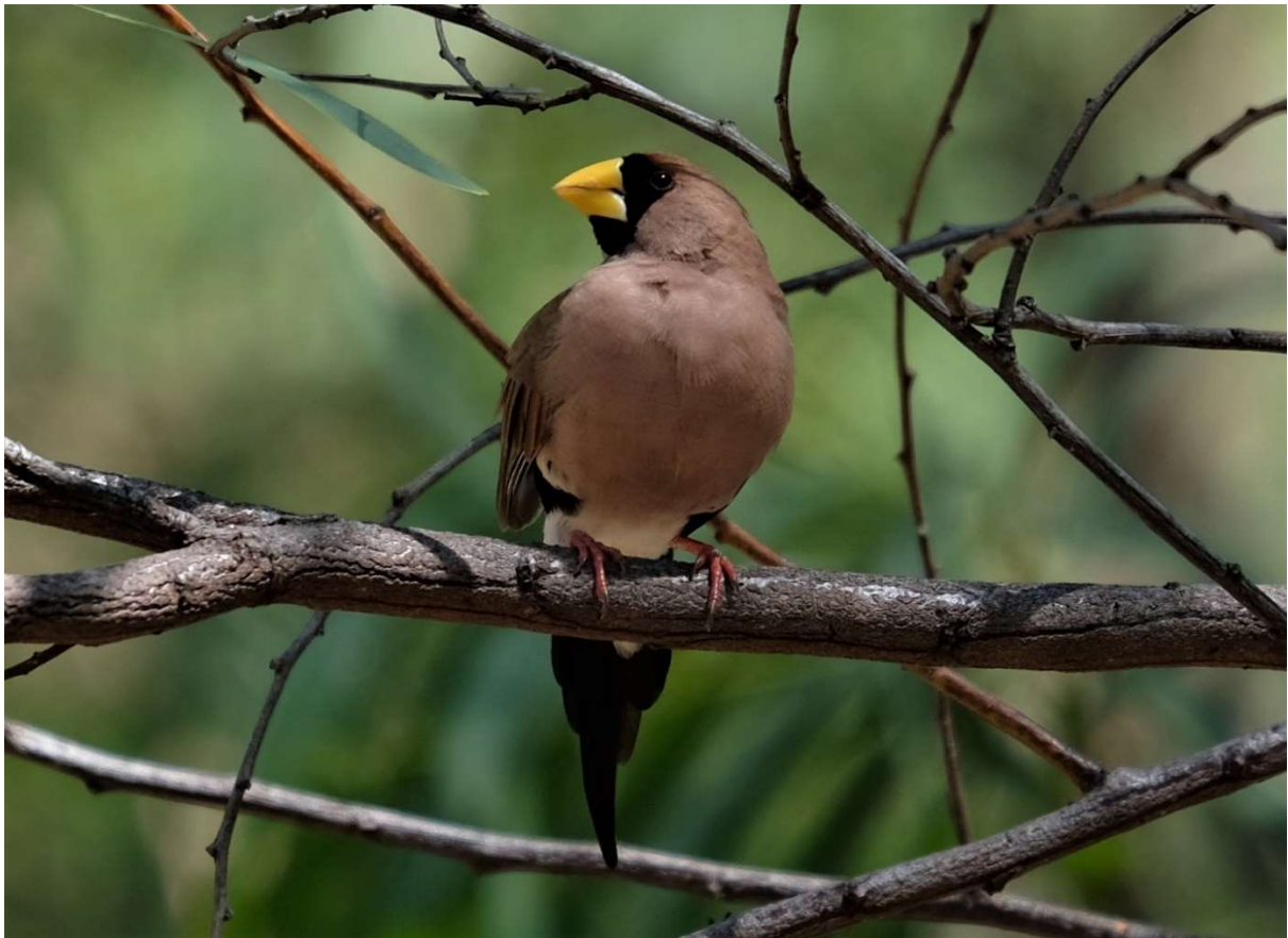
Masked Finch near the Lee Point Caravan Park in Sept 2021

Masked Finch ( Poephila personata ) – Status: Near Threatened under IUCN 3.1