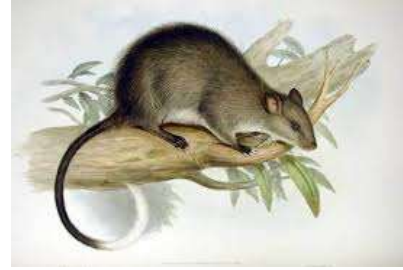
Black Footed Tree Rat

Options to deal with feral and domestic cats such as; cat containment, trapping of cats and cat proof fencing all involve capital and maintenance costs for the taxpayer.