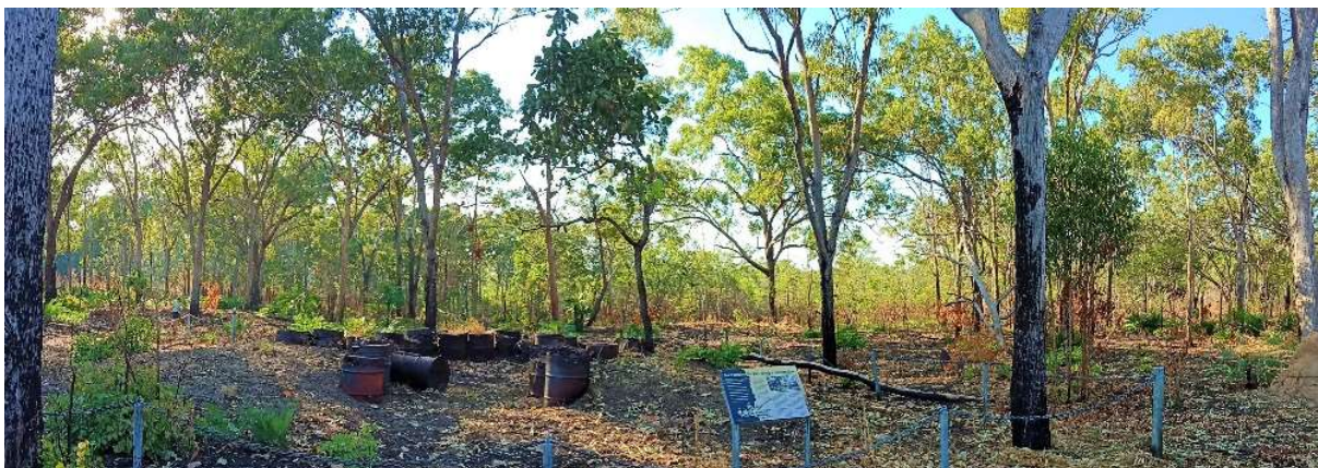
Defensive gun pit on lot 9370

For defence history, it would mean obtaining and displaying additional defence relics/signage as many of the relics have been removed. Based on the NT EPA (Ref 7, Sect 5.1.2), lot 4873 contains the remains of a missile launching facility and explosives store, and remnants of anti-aircraft battery sites. Lot 9370 has the remains of a defensive gun pit.