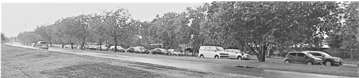
Vanderlin/Lee Point Road roundabout (looking east) – morning peak hour – Sept 2020

Traffic delays from queueing (see photo below) were generally less than two minutes.