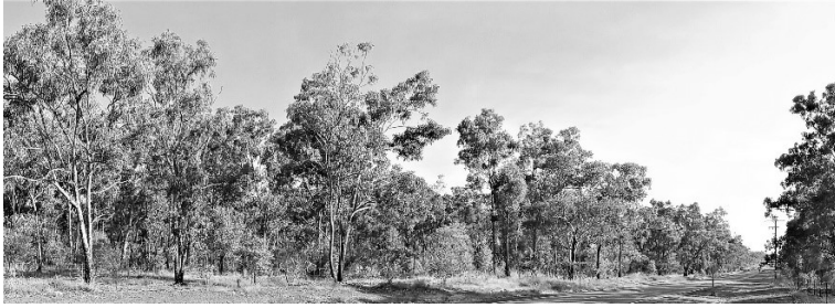
Photo of Lee Point Road (looking north), Lot 4873 on the left, and lot 9370 on the right.